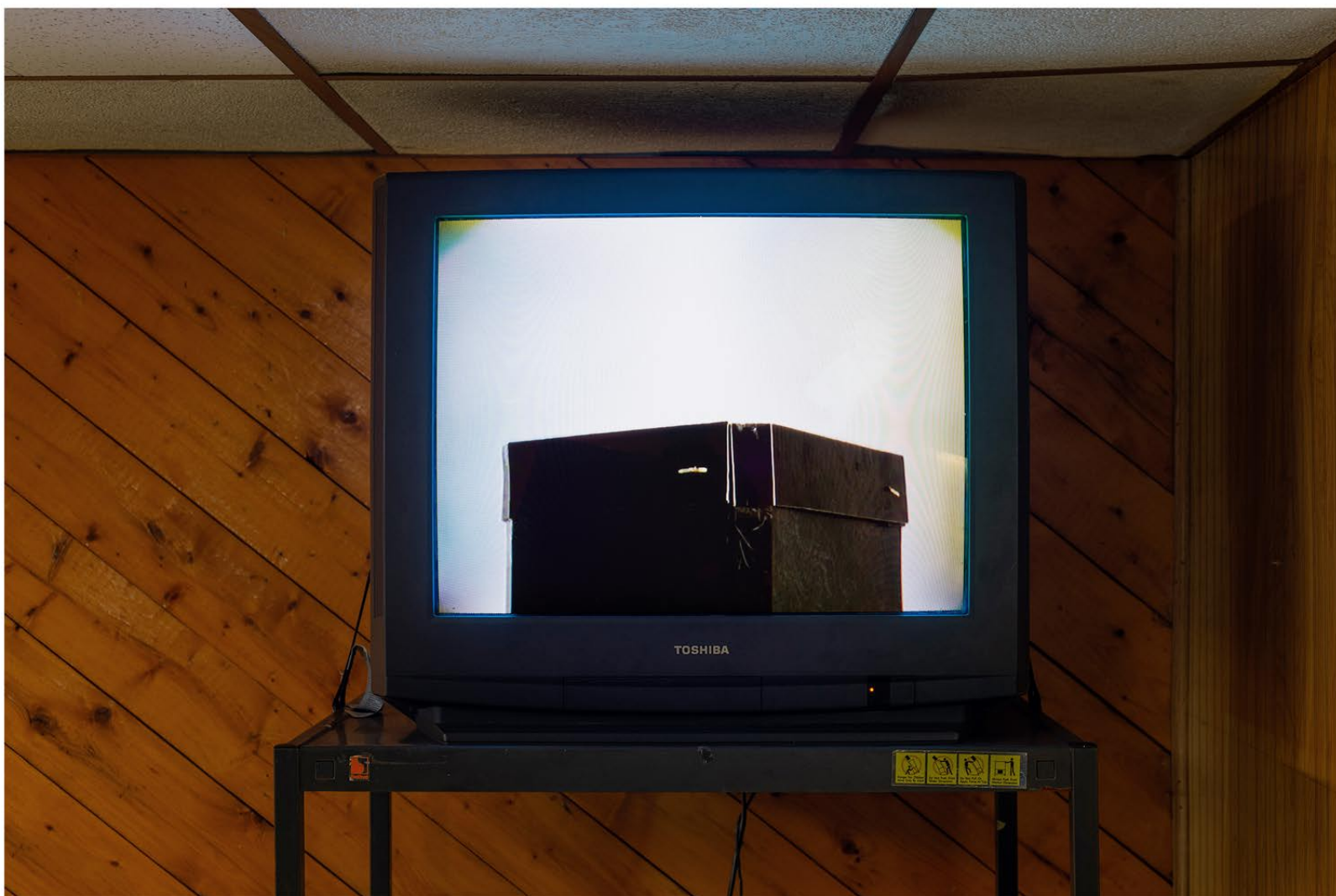
A Photograph From 2014, 2019 Still image, monitor, media cart 78 x 33 x 22 inches