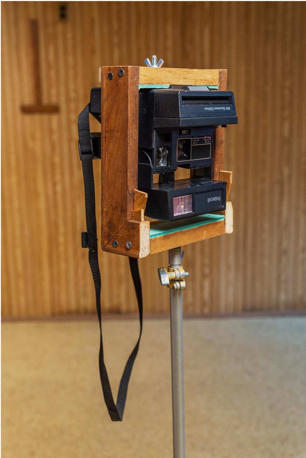
Untitled (camera) , 2019 Polaroid camera, metal, wood 30 x 30 x 63 inches