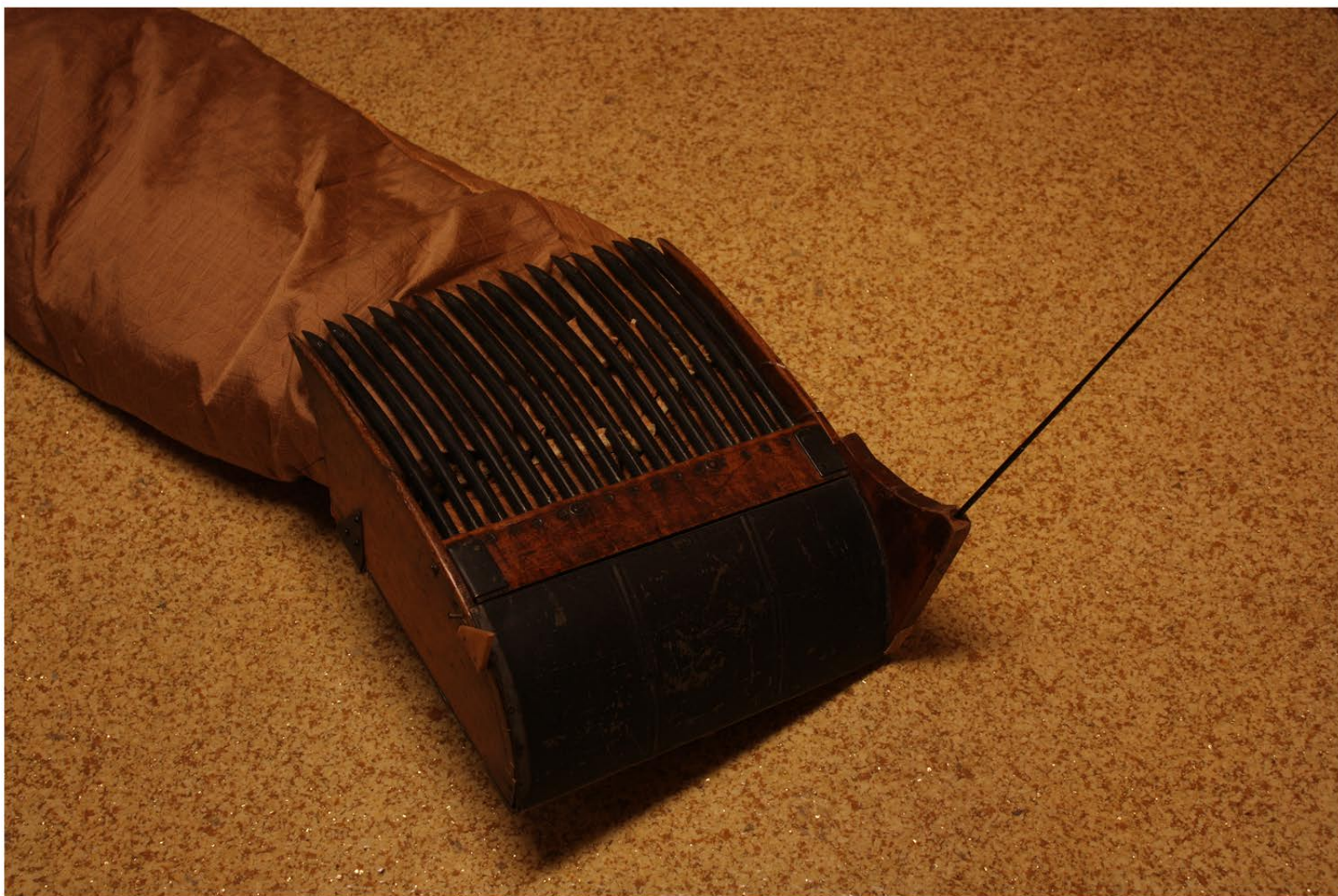
It is Not Fun Anymore (b) , 2019