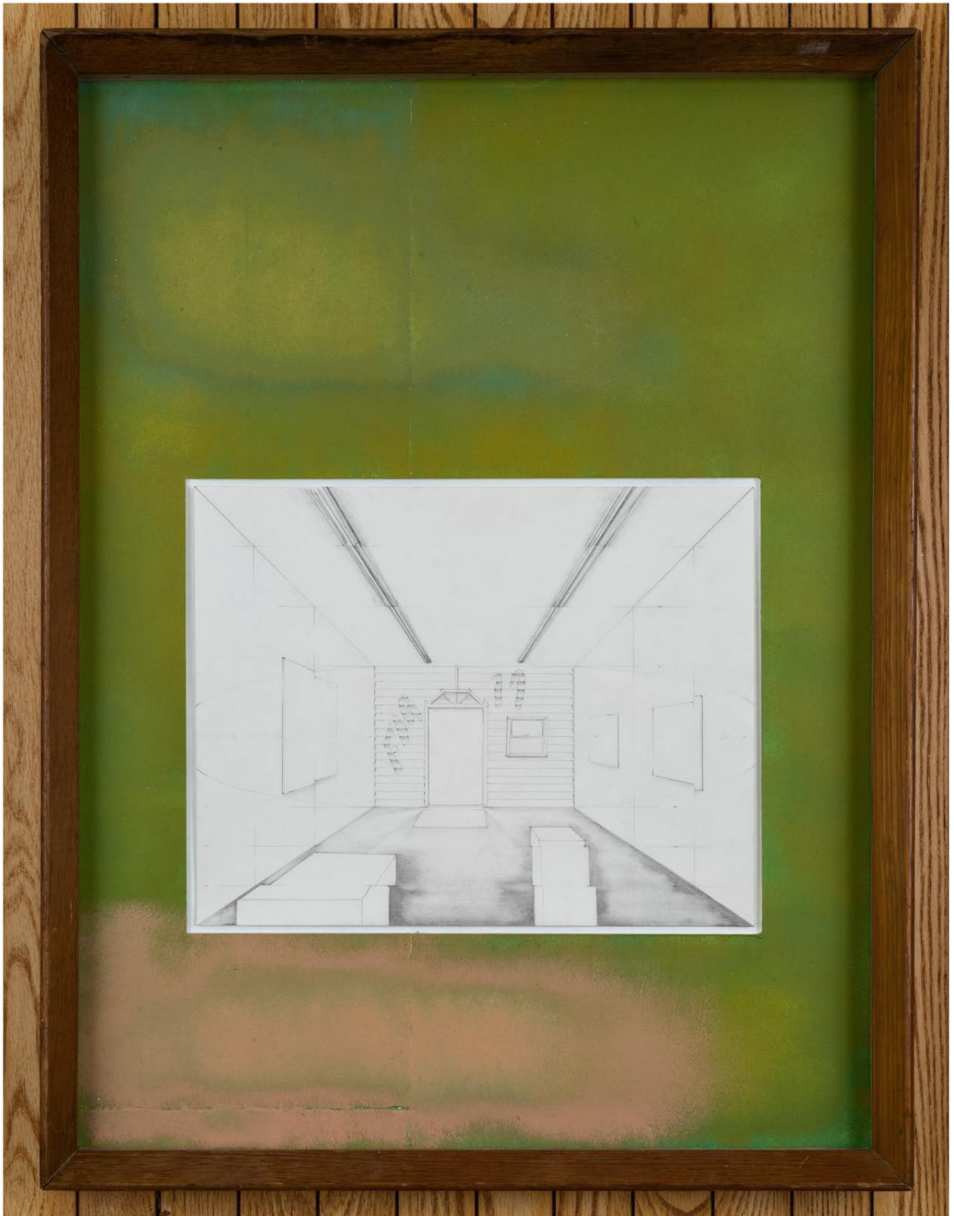
Fig 18, 19, 20, 2019 Mixed media 21 x 28 Inches