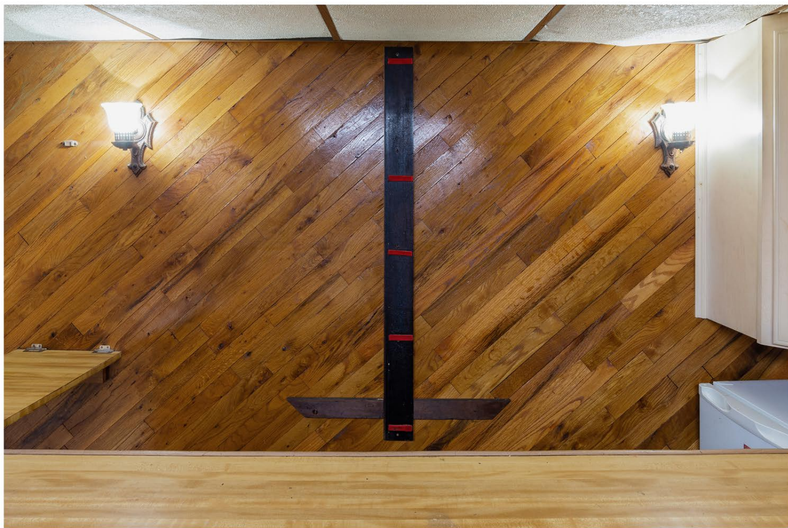
Large T-Square, 2019 Felt, piano parts, stretcher 29 x 51