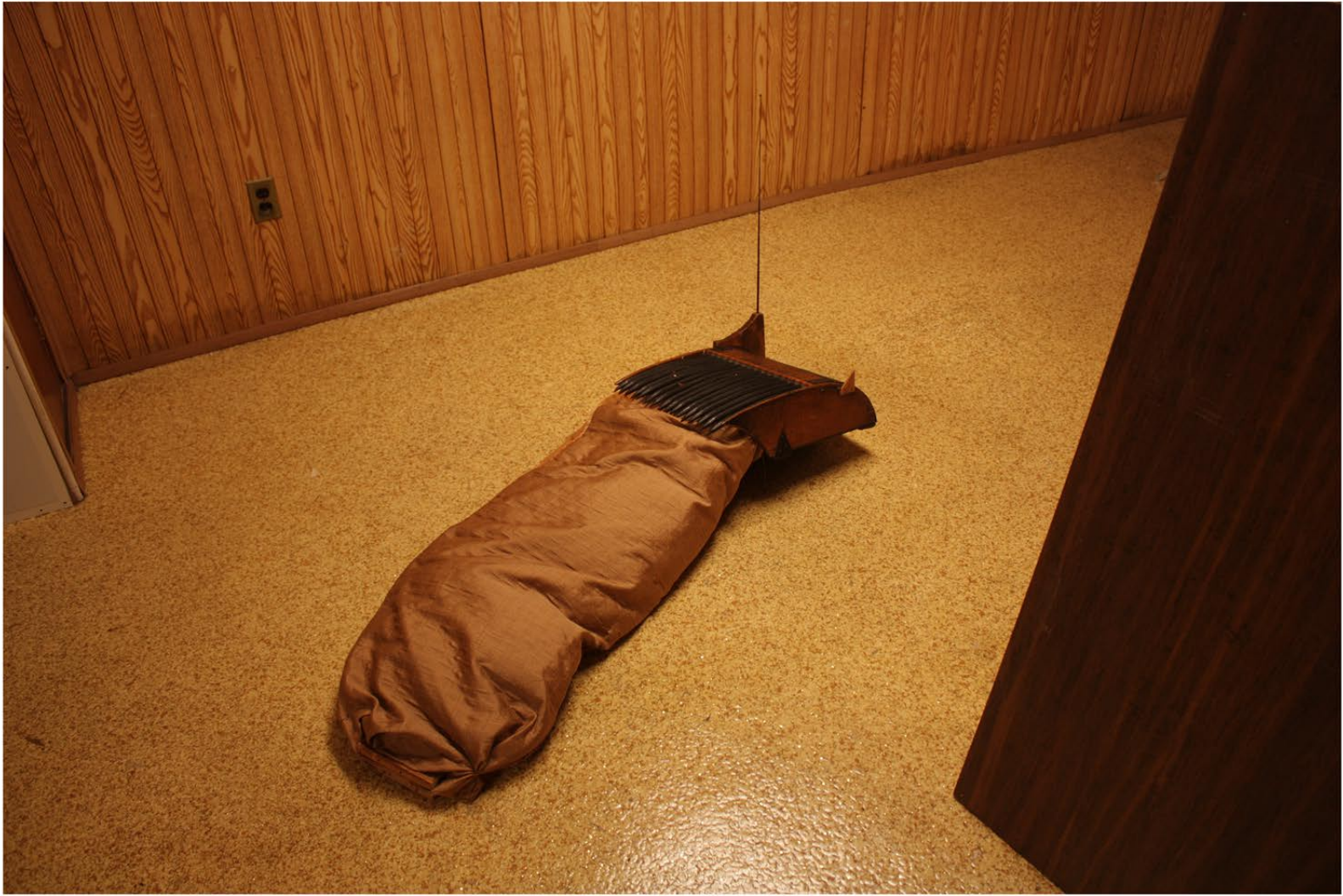
It is Not Fun Anymore (b) , 2019