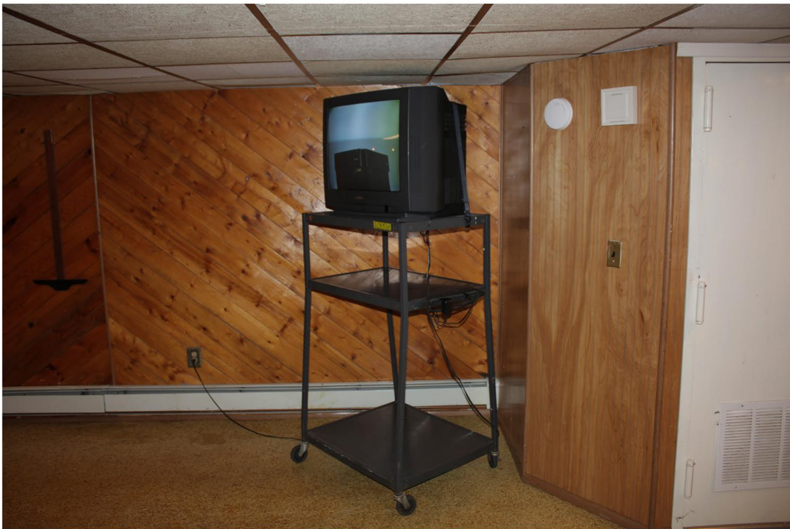
A Photograph From 2014, 2019 Still image, monitor, media cart 78 x 33 x 22 inches