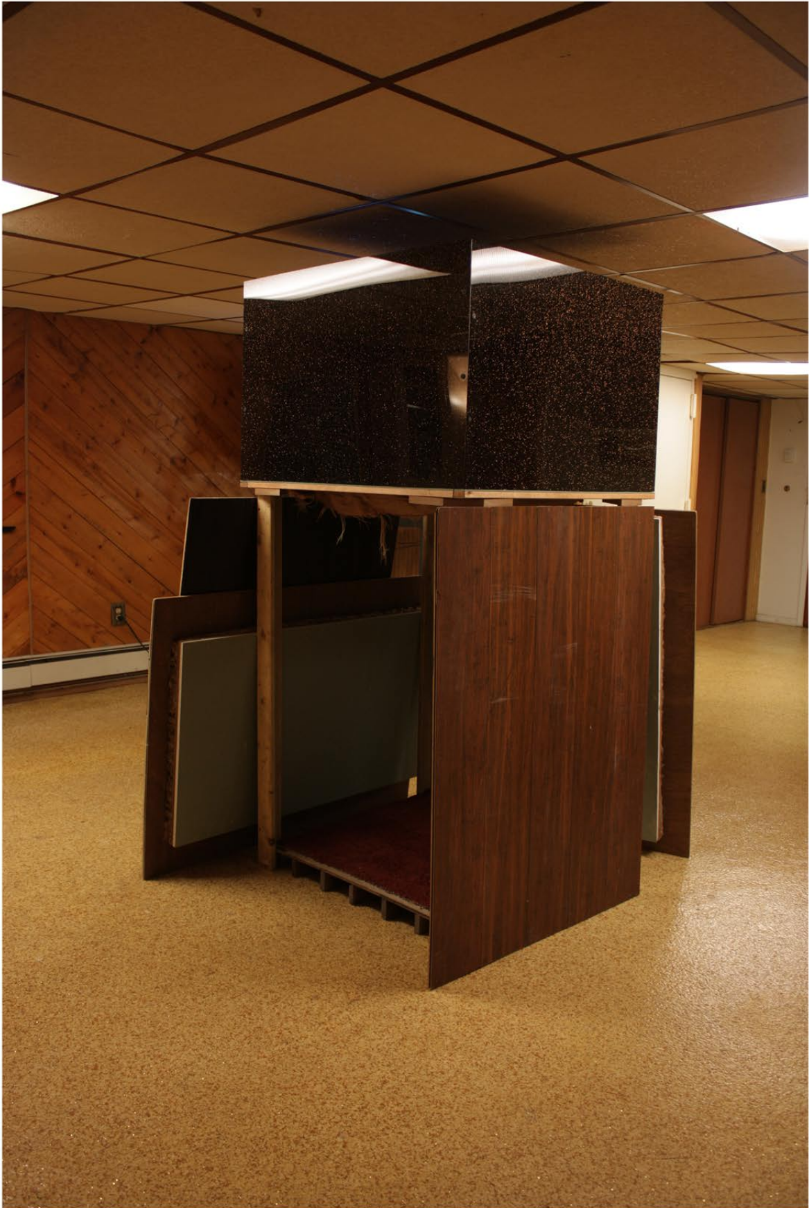
Now You Know , 2019 Mixed media 74 x 46 x 50