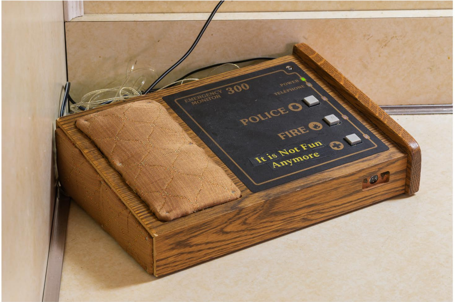
It is Not Fun Anymore (a) , 2019