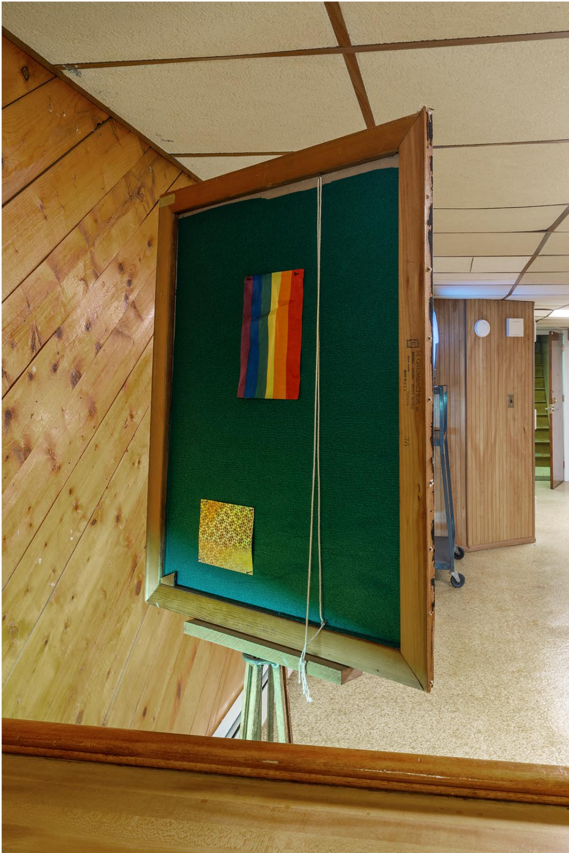
Idea of a Clover , 2019 Mixed media 60 x 20 x 26 inches