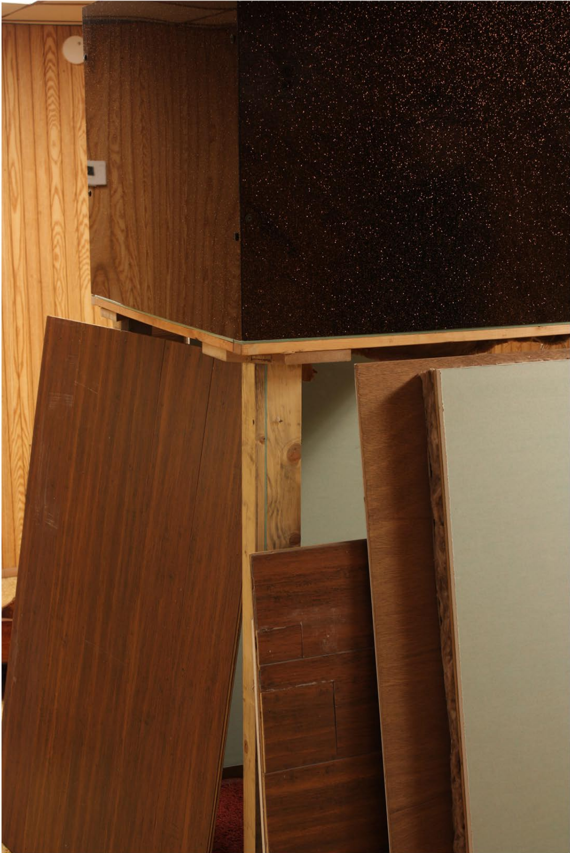
Now You Know, 2019 Mixed media 74 x 46 x 50