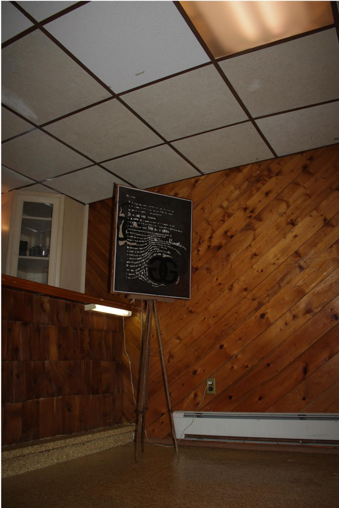
Idea of a Clover , 2019 Mixed media 60 x 20 x 26 inches