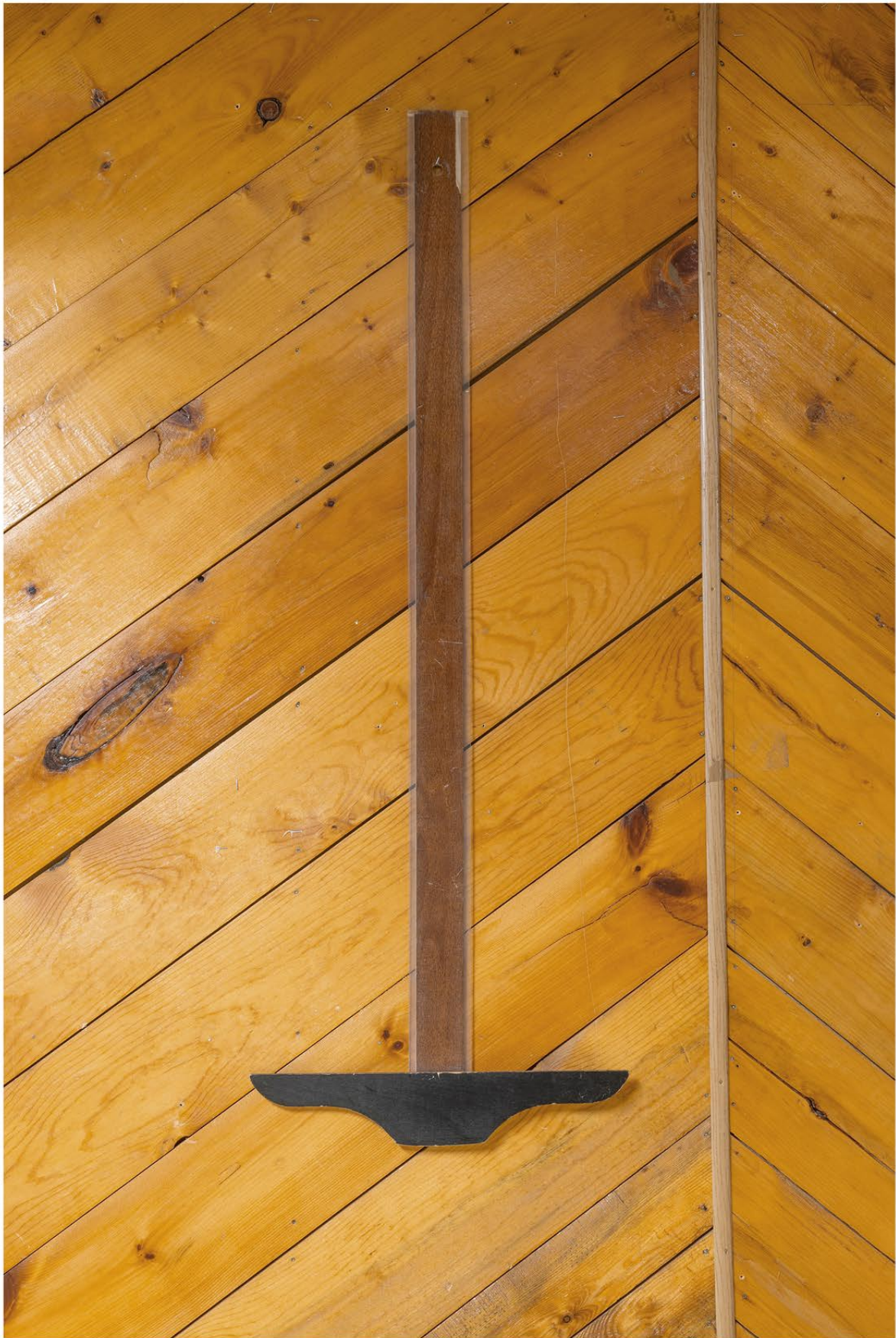
Medium T-Square, 2019