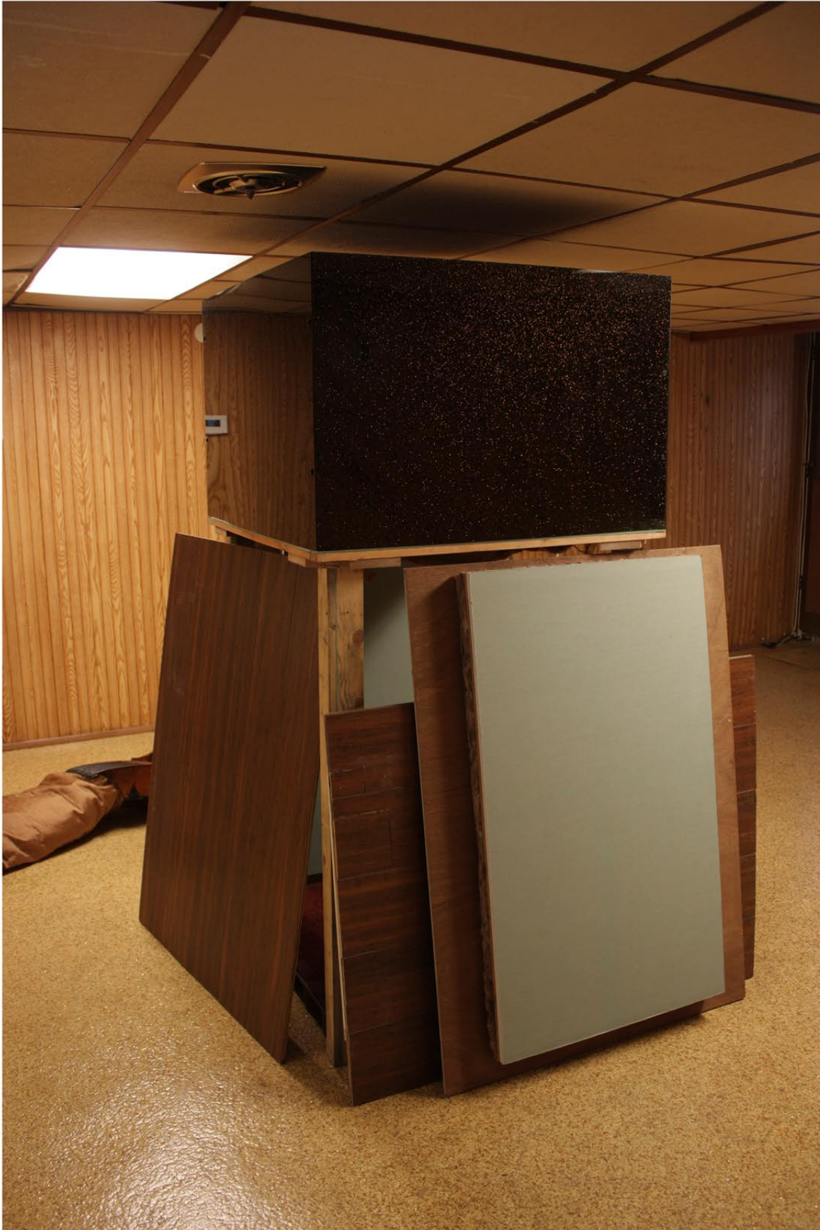
Now You Know , 2019 Mixed media 74 x 46 x 50