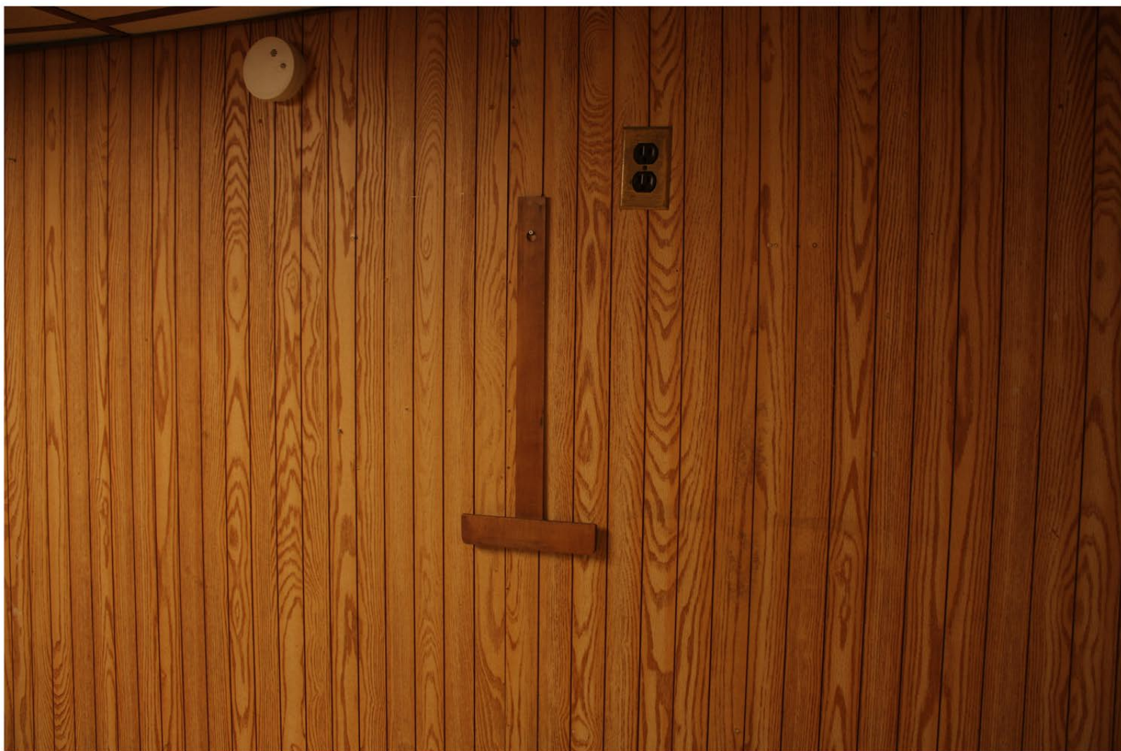
Small T-Square, 2019 T-Square 20 x 8 inches